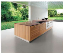
124 Kitchens with spark The best systems serve up everything from luxury to functionality