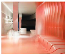
130 Smooth surfaces The most innovative solid surfacing, laminates and alternatives