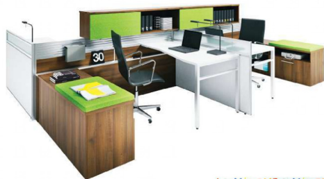
↑ Exhibitor ThreeH updates its MultiStations OS line with an Enhancements option for more storage. → Glass panel manufacturer Skyline shows off a marker-friendly line for kids.

After debuting innovative benching systems and iPod recharging task lights at NeoCon in Chicago, office furniture manufacturers from both sides of the 49th parallel head to Toronto to present still more variations of their work environments. Keep an eye out for Allstate's Inspire seating and Humanscale's retro-modern Element Vision LED task light as well as an playful wall systems as Skyline's Kids Glass series. This September, showgoers are treated to lectures by four keynote speakers: industrial designer Arik Levy, architect Craig Dykers of Snehetta, economist Jeremy Rifkin, and Designer Pages co-founder Avi Florbaum. Alongside recurring features like Think-Material and Light Canada, interior design firm Yabu Pushelberg creates the all-new YP Picks, an exhibit of materials from its favourite projects; and German manufacturer Hettich unveils the kitchen of the future at the Kitchen Concept 2015 special feature. idexneocon.com